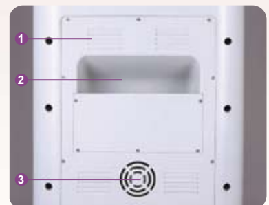
1 Fix cover 2 Depositing Box 3 Fan